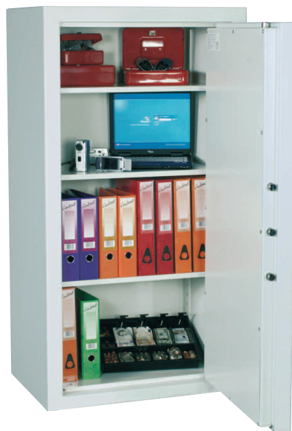
Shown with optional electronic lock