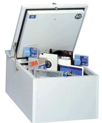
Data protection Insert DPI08

Optional Extras Available Key lock on each drawer REDL2 Electronic Lock REDL2 Electronic Lock & Key Lock Fingerprint lock Cut Key Data Protection Insert